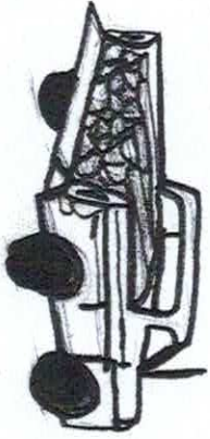
1/4 cord of wood