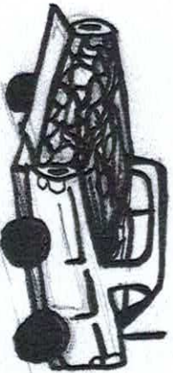
1/2 cord of wood