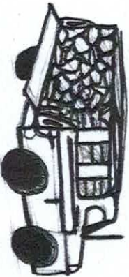
1/2 cord of wood