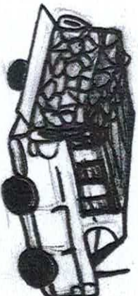
1 cord of wood