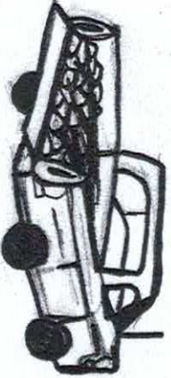
1/4 cord of wood