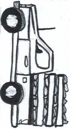
2 cords of wood